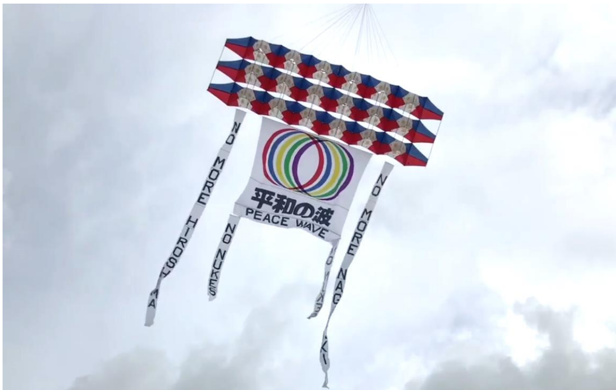
Peace Wave Kite-Flying conducted by the Pilonas family of Santiago, the Philippines on August 6

Many thanks to you all, from the grass-roots peace groups/individuals to international organizations for joining the Peace Wave that circled around the globe from August 6 to 9. Numerous reports/plans, news articles/clippings, movies on YouTube and webinar results reached us from 24 countries. We have been deeply impressed and amazed by the strong commitment expressed by the peace movements to the cause of creating a nuclear weapon-free world. Please refer also to more listing of activities on the Peace Wave News Vol.1 , Vol.2 and Vol.3 .