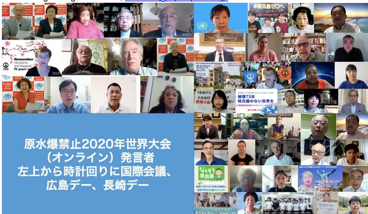
Featured speakers in the 2020 World Conference against A and H Bombs online on August 2, 6 and 9.

Contact: Organizing Committee, antiatom@topaz.plala.or.jp