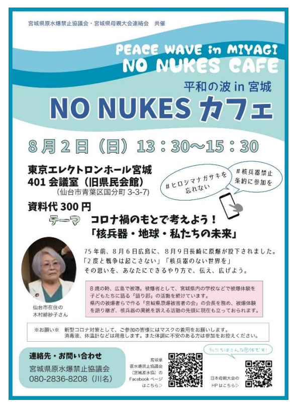
and H Bombs on August 2, 6 and 9.